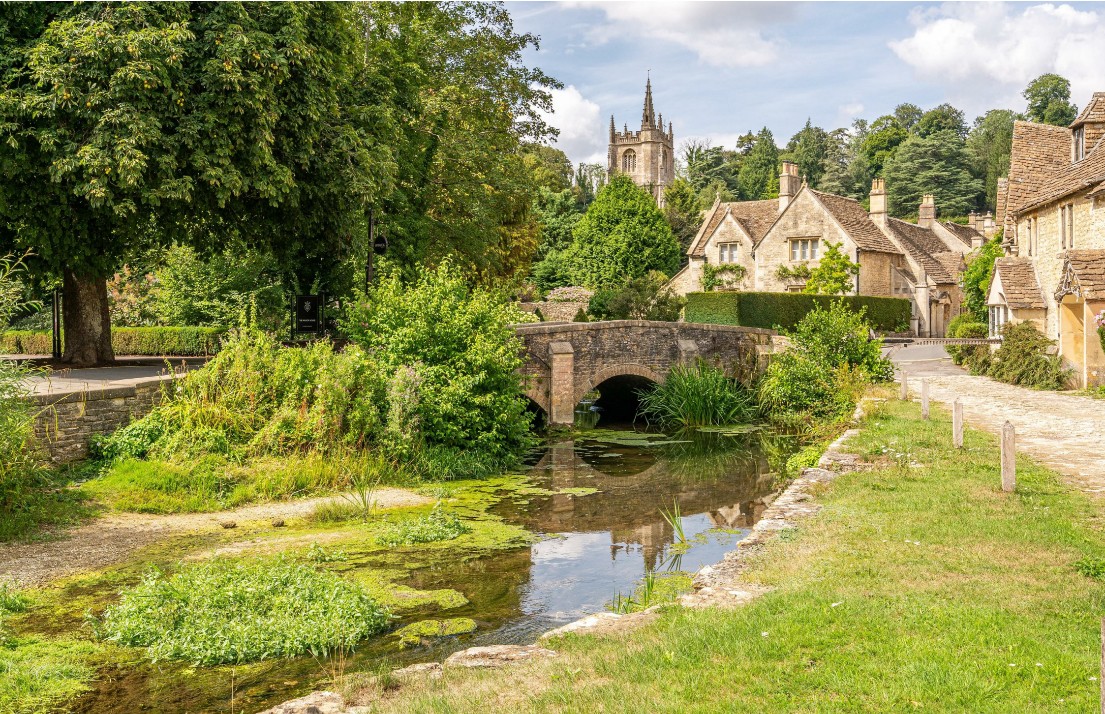
View from The Weavers House into Castle Combe village