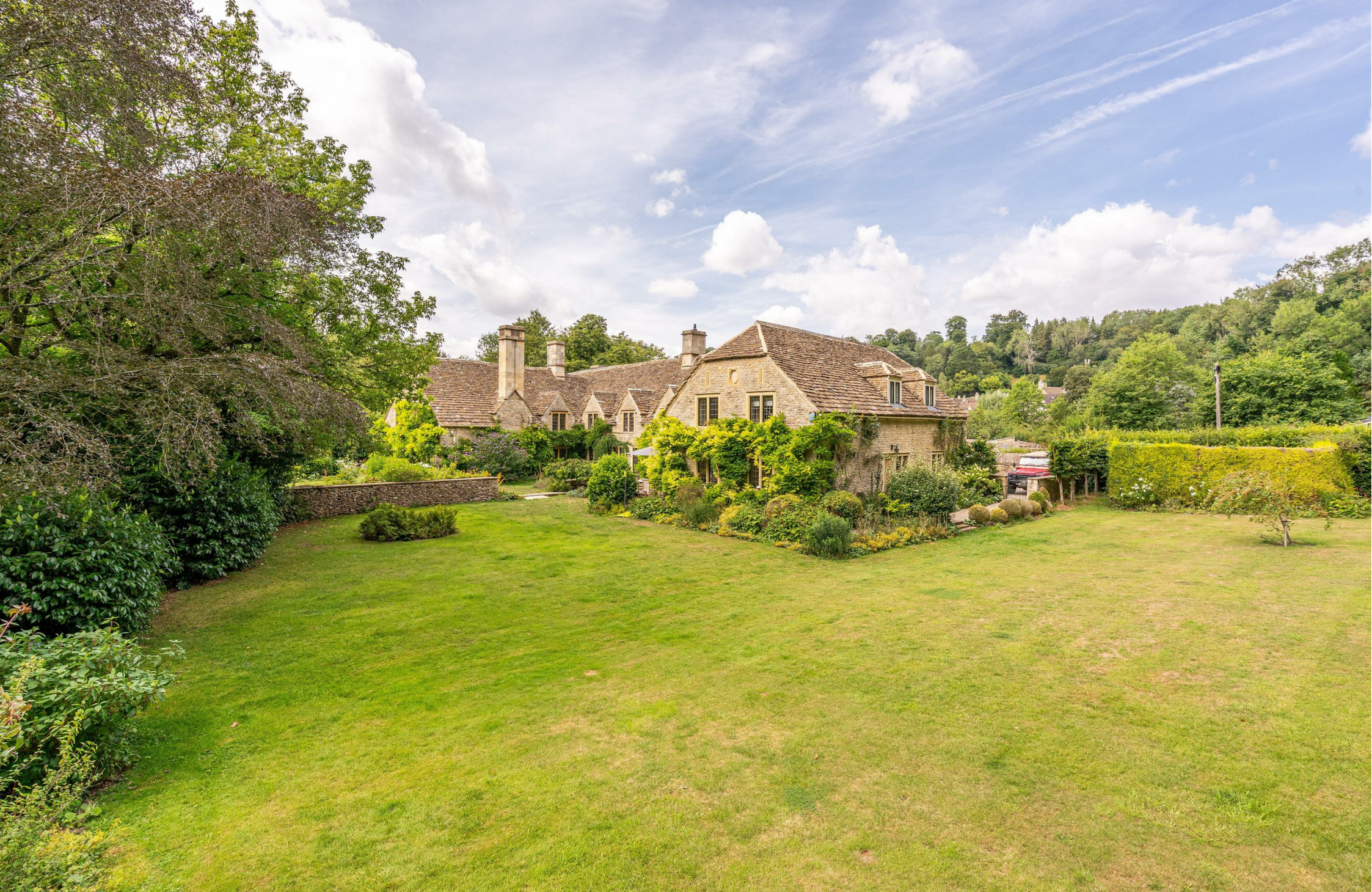
View from the back garden